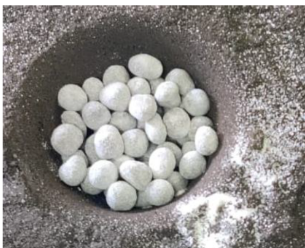
Figure 3 – Active filter grains

In the second series of experiments, primary aluminum was smelted in a laboratory induction furnace. Next, aluminum was filtered through an active filter with grains treated with boric acid (Figure 3). This step allows reducing the processing time of primary aluminum by combining the stages of refining and filtration, as well as removing hard-to-remove impurities of transition compounds in the Al-Ti-B-V-Fe-Zn system.