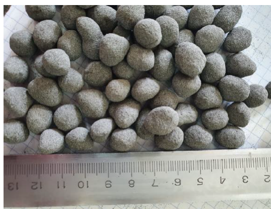
Figure 2 – Filter grains

As a result of the search for the optimal material for the purification of primary aluminum from heavy metal impurities, it was decided to use Ekibastuz coal ash (Figure 2), with an Al_2O_3 content of about 30 – 32 %. Aluminum oxide is the most preferred base for chemical reactions occurring in the Al-Ti-B system during the extraction of heavy metal impurities.